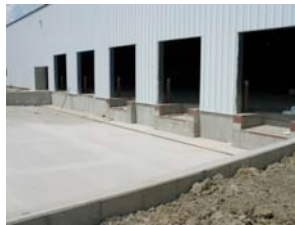
TRUCK DOCK BEFORE PADS WERE INSTALLED