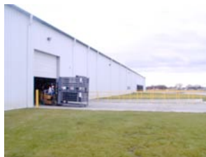
FUNCTIONAL WAREHOUSE FACILITY IN UTILIZATION