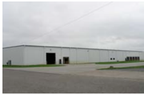
THREE ACRES UNDER ROOF